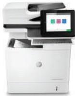
HP LaserJet Enterprise Flow MFP M634h

Dynamic security enabled printer. Only intended to be used with cartridges using an HP original chip. Cartridges using a non-HP chip may not work, and those that work today may not work in the future. http://www.hp.com/go/learnaboutsupplies