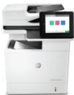
HP LaserJet Enterprise MFP M635h